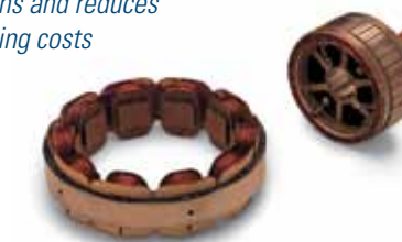
Unison improves existing non-Unison PMG designs and reduces manufacturing costs

In addition to manufacturing products of our own proprietary design, Unison is a cost-effective "build-to-print" manufacturer serving aerospace and industrial markets. Unison fully integrates these operations into our highly developed quality and production control systems, while maintaining a low cost base that "build-to-print" customers expect.