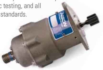
Integral Rotor and Stator PMG for A250 engine

No one knows Unison products better than Unison. As the original equipment manufacturer and FAA-PMA Approval holder, Unison has the best understanding of the methods needed to ensure product quality and reliability. For those customers who elect not to perform their own service, Unison Service Express SM overhaul and repair programs offer a fast, reliable means for product service. Unison's Alternator Express SM exchange program provides remanufactured replacement parts within a 4-day turnaround time, and repair programs deliver your original part back to you within 20 days. Every stator undergoes full-function dynamic testing, and all rotors are checked and balanced to exacting standards.