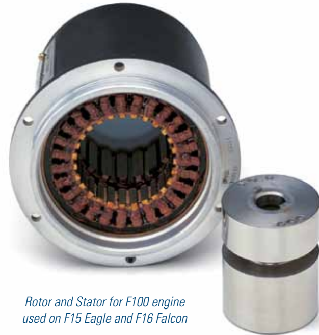
Rotor and Stator for F100 engine used on F15 Eagle and F16 Falcon

Unison combines engineering expertise and a commitment to deliver custom solutions. Thanks to innovative product development and superior customer support, we can design and build to match any application. From commercial aircraft where our PMGs power engine FADECs to cruise missile ignition, ground-based microturbine electrical generators and oil wells, our highly reliable, extremely durable PMGs have proven effective for a variety of applications over a wide range of markets.